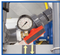
PSI TO MEASURE CLEANLINESS