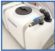
50 GALLON - SAFE CHEM/WATER FILL PORT