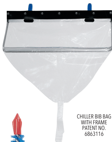
CHILLER BIB BAG WITH FRAME PATENT NO. 6863116

R5SFVS-45: Same as R5SFVS-45Q, except with threaded fittings..... Call for Price