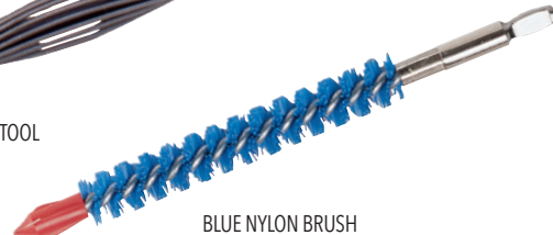
BLUE NYLON BRUSH