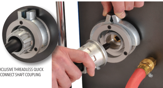
EXCLUSIVE THREADLESS QUICK CONNECT SHAFT COUPLING

Note: Visit Goodway.com for shafts and accessories.