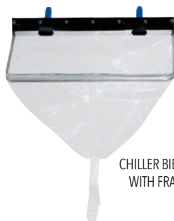
CHILLER BIB BAG WITH FRAME