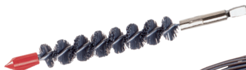
SPIN GRIT BRUSH