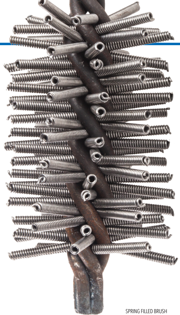
SPRING FILLED BRUSH