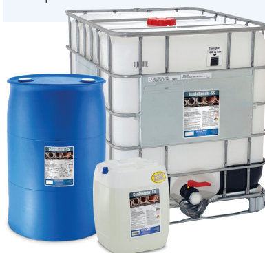
ScaleBreak-SS is available in 5, 30, 55, 275 & 330-gallon totes.

In today's industrial environment, companies cannot afford to have unexpected equipment shutdowns or failures. Preventative maintenance programs are more important than ever for heat transfer, energy efficiency as well as prolonging equipment longevity. Equally important is having the correct tools to perform your cleanings. Goodway ScaleBreak-SS was specifically formulated for the safe removal of scale deposits within stainless steel based equipment.