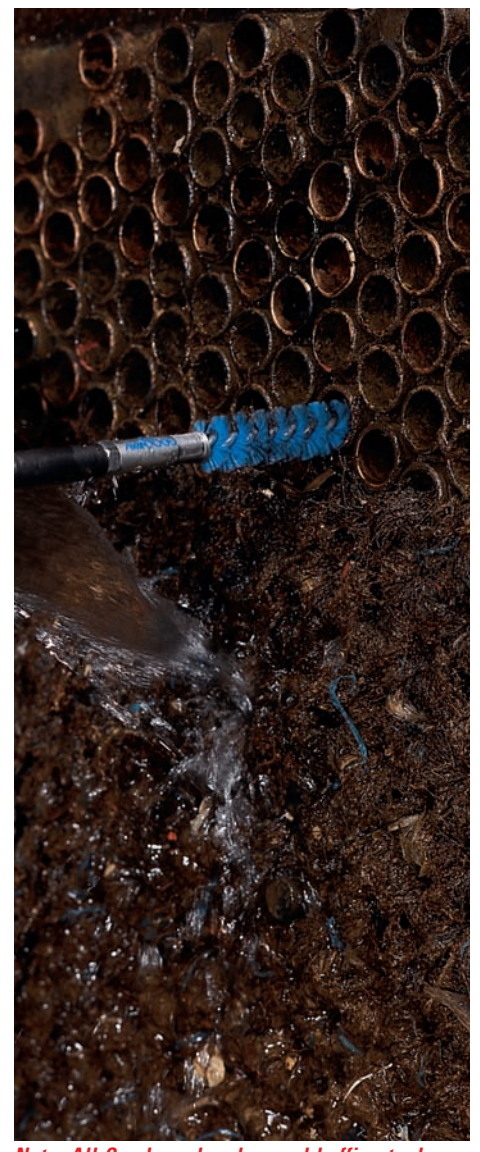
Note: All Goodway brushes and buffing tools are available with standard threaded tool couplings. To order, remove the "Q" from the part number.

These brushes are designed to clean the lands and grooves of internally enhanced tubes.