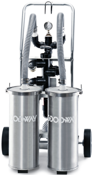
CTV-F2 FILTRATION SYSTEM